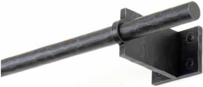
3/4" Harrison Petite Bracket with Bauhaus Finial