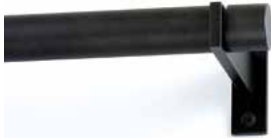
1 1/4" Casa Bracket and 1" Bauhaus Finial w/ Wrought Iron Gray Finish