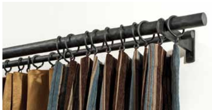
Coco Double Curtain Rod