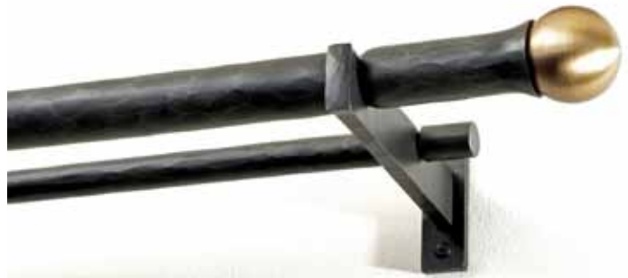
Coco Double Bracket with Ball Finial & Short Bauhaus Finial