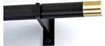
1 1/4" Casa Bracket and Extended Brass Bauhaus Finial w/ Wrought Iron Gray Finish