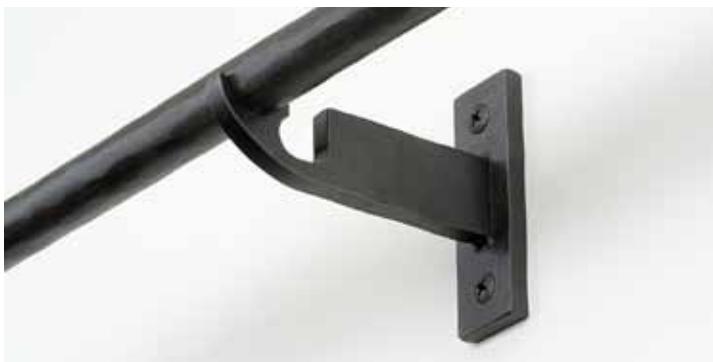
By-Pass Bracket 3/4" #03355, 1 1/4" #03455