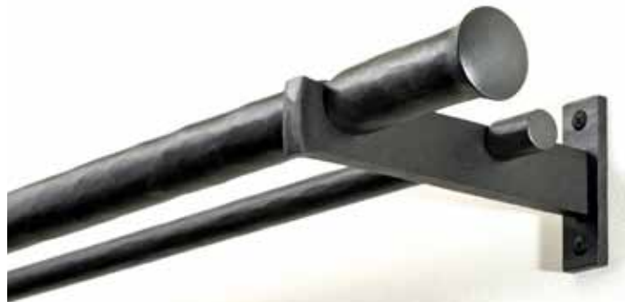
Coco Double Bracket with Flair Finial & Short Bauhaus Finial