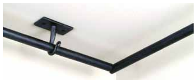
Olivia Ceiling Center Bracket with Rod Hinge

Our company has the most Ceiling Curtain Rod styles. We have standard drop sizes and the ability to make custom drops when you need to clear soffits or other architectural details. Create a vestibule around drafty doors or a simplified installation for bay windows. Dramatic around beds as well as for floor to ceiling drapes.