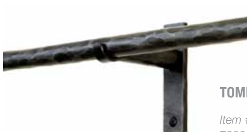
Tommy Center Bracket

Authenticity meets function in our Tommy Hardware line. A hammered nail head finial with matching hammered bracket ends. A flattened link keeps rods and brackets on the same plane. Excellent when you want hardware close to the ceiling or non-intrusive. All rods are welded to your size. Available in 1/2" diameter only.