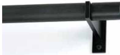
1 1/4" Casa Bracket and 2" Bauhaus Finial w/ Wrought Iron Gray Finish