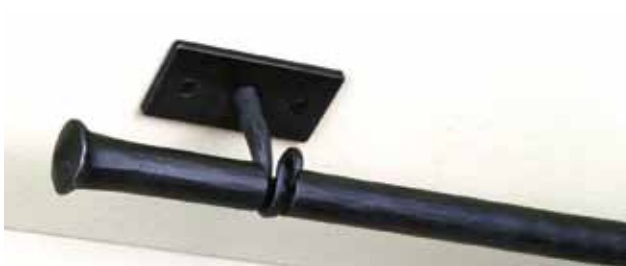
Olivia Ceiling End Bracket with Flair Finial