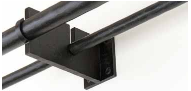
Harrison Grande Double Center Bracket