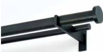
Casa Double Curtain Rod