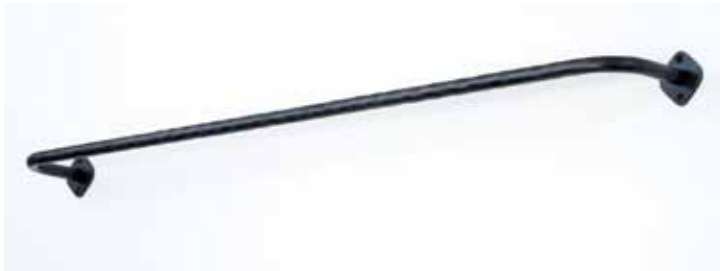
3/4" Dia. Return Curtain Rod