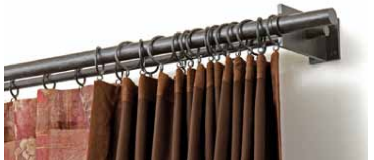
Harrison Double Curtain Rod