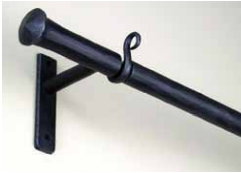
Olivia End Bracket with Flair Finial