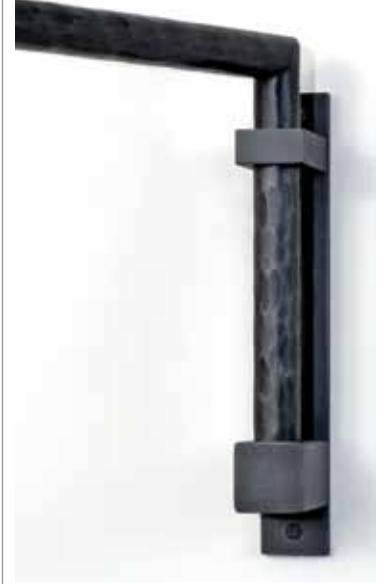
1" Dia. Crane Curtain Rod Detail

Our Crane Rods are designed to operate smoothly, while upholding their reputation as the strongest in the industry. 1" Crane Rods are capable of holding long banners, quilts, tapestries as well as heavy curtains up to 6' wide without end support. 1/2" rods have 3 projections [3/4", 2" and 3"] in order to place the rod in the right position over moldings or when extended out from the wall. Ball finials are included with 1/2" rods only. Available in Wrought Iron Gray, Antique Bronze or German Silver Finish.