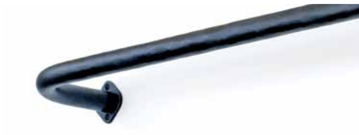
1 1/4" Return Curtain Rod End Detail