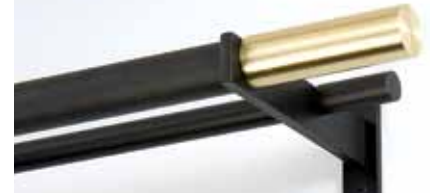
Casa Double Curtain Rod

Our newest hardware line, the Casa Collection features smooth curtain rods in 3/4" and 1 1/4" diameters with minimal brackets. Available with some exciting new finials in brass and iron.