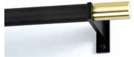
1 1/4" Casa Bracket and 2" Brass Bauhaus Finial w/ Wrought Iron Gray Finish