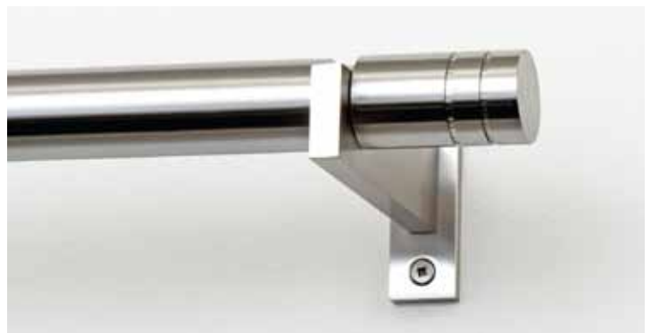
1 1/4" Mira End Bracket with Short Bauhaus Finial and Chase Detail