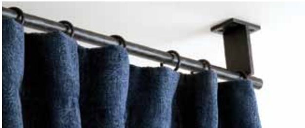
Harrison Petite Ceiling Bracket