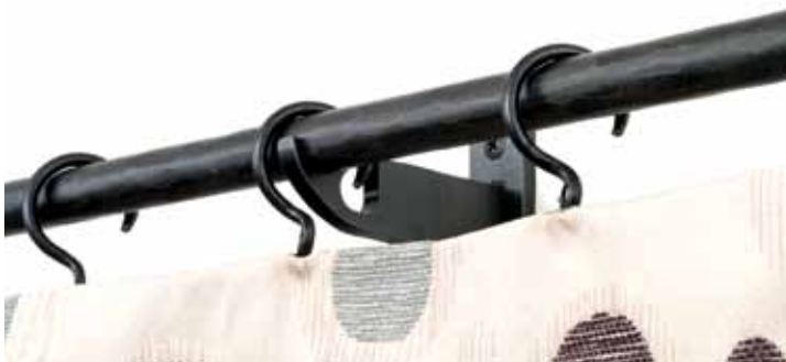
By-Pass Bracket with C Rings