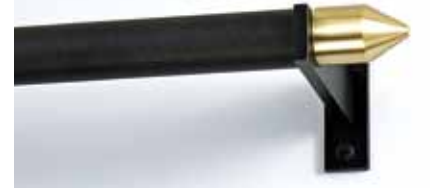
1 1/4" Casa Bracket and Brass Bullet Finial w/ Wrought Iron Gray Finish