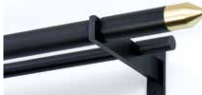
Casa Double Curtain Rod