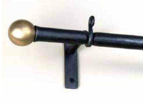
Olivia End Bracket with Ball Finial

Our Olivia Hardware is the most traditional style featuring hand forged solid steel brackets and finials. 1/2" rods are solid, 3/4" and 1 1/4" rods are tubular. Available in Wrought Iron Gray, Bronze or German Silver Finish.