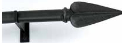
1 1/4" Casa Bracket and Lancea Finial w/ Wrought Iron Gray Finish