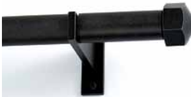
1 1/4" Casa Bracket and Hex Finial w/ Wrought Iron Gray Finish