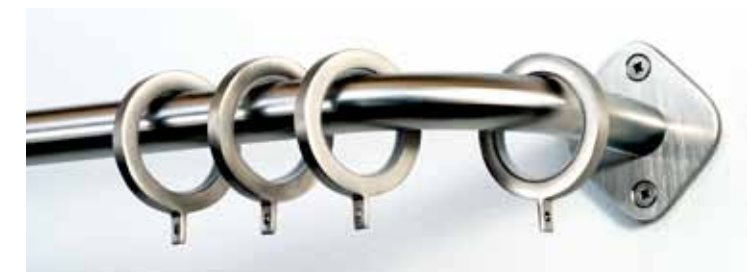
3/4" Dia. Stainless Steel Return Curtain Rod Detail

Our Return Rods are clean and elegant yet sturdy and functional. A minimal curtain rod with no finials, perfect for eliminating light or to conceal window frames. Available in 3/4" and 1 1/4" diameter iron rod, also in 3/4" diameter stainless steel rod.