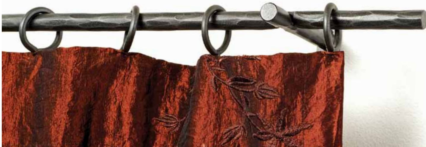
½" Lincoln End Bracket and Finial