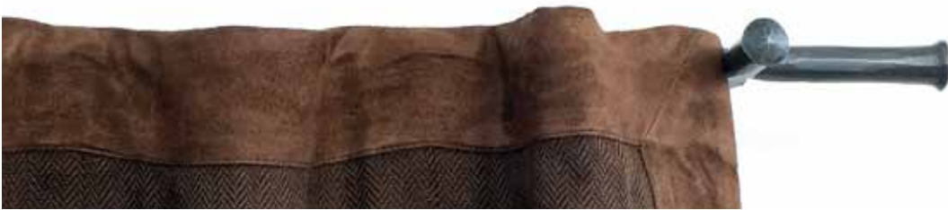
Tommy End Bracket with Flair Finial