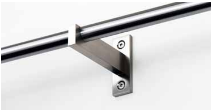
Mira Center Bracket