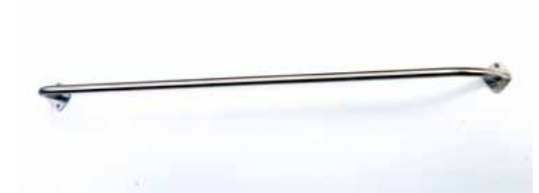
3/4" Dia. Stainless Steel Return Curtain Rod