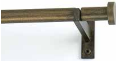
3/4" Casa Bracket and Short Disc Finial w/ Antique Bronze Finish