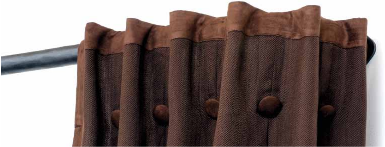
1 1/4" Return Curtain Rod