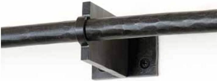
3/4" Harrison Petite Center Bracket