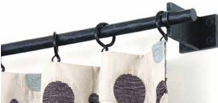
3/4" Harrison Petite Bracket with Short Bauhaus Finial